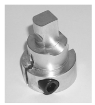
3x2 overload blocks